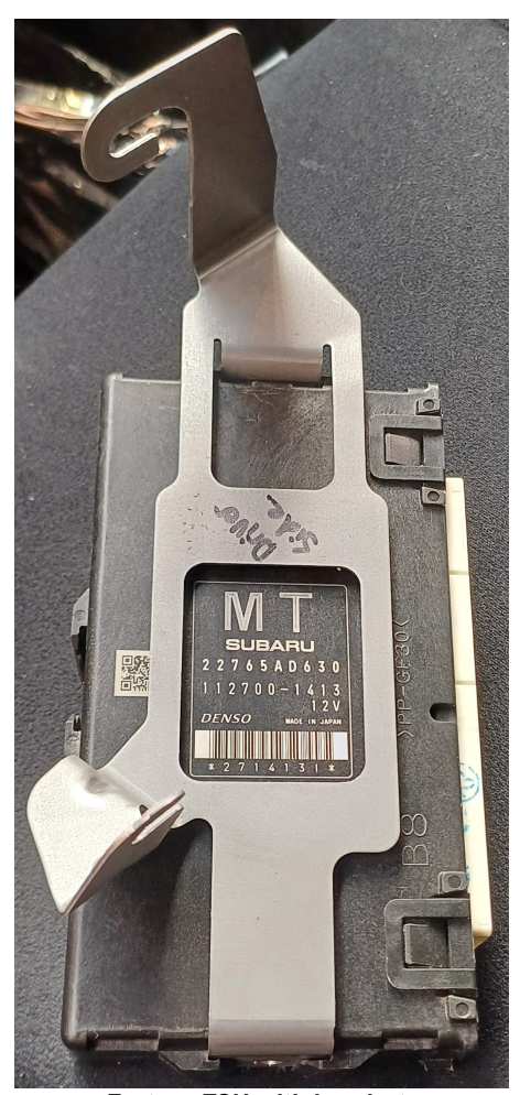
Factory ECU with bracket.

To install the Link Toyota GT86/Subaru BRZ plug and play ECU follow the steps below: