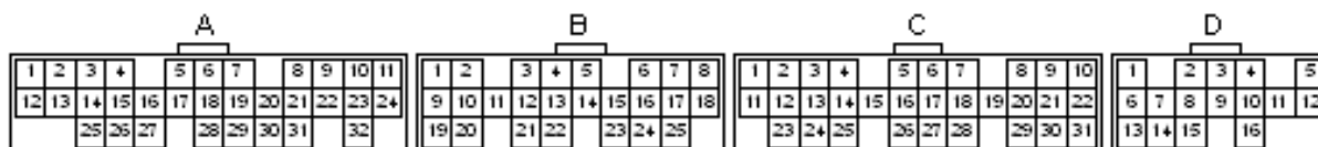
CivicLink (98) V1.2